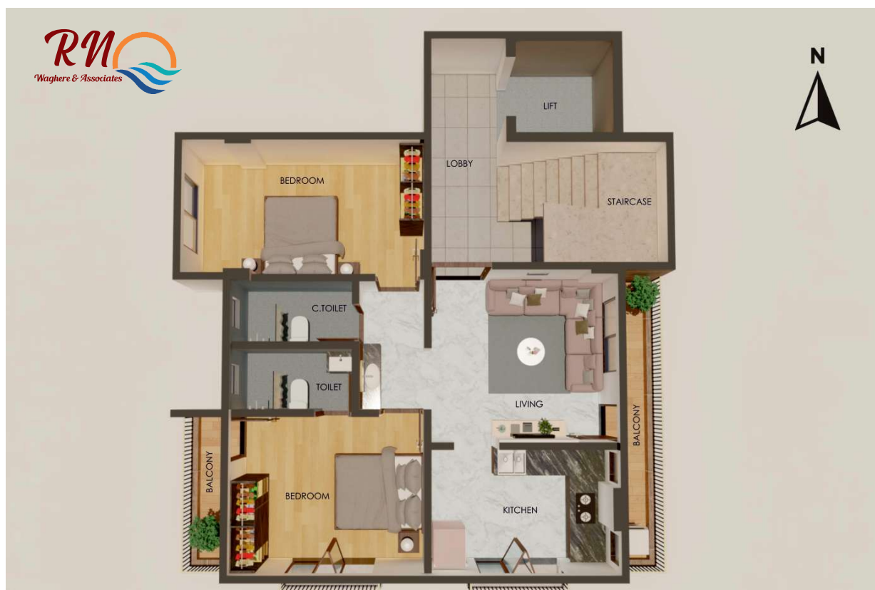
Typical plan Front Side (South) Flat No.: 102/202/302/402 / 502 Measurement : Carpet : 528.40 sq.ft. Open Balcony: 089.99 sq.ft. Enclosed Balcony: 109.79 sq.ft.